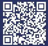
RUT955 360° VIEW